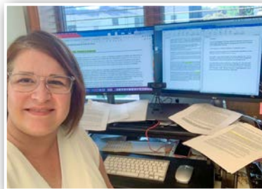
2021: Preparing for Zoom Court hearing

Over the past two years, our firm has also grown in another important way. We have developed a flourishing estate planning practice, helping more than 60 families so far across Virginia create wills, trusts, and plans that protect the people they love most. Planning for the future is one of the greatest gifts you can give your family, and it is an honor to help clients take that step with confidence.