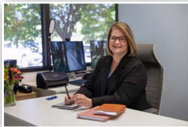
2025: New Springfield Office