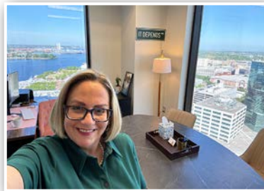
New Norfolk Office