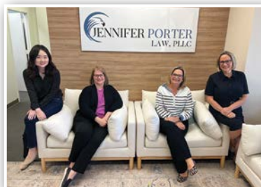
Our 2026 Legal Team